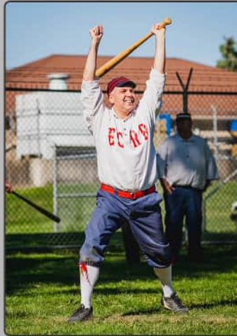
A Railroader celebrates during a match in 2020

The Salmon will be hosting the Elkhart County Railroaders and the McHenry County Independents at the Historic Methodist Campground in Des Plaines, IL on Sunday, June 5th. The match begins at 1:00pm and will be followed by a world famous Boss Lady banquet. Spectators are highly encouraged, so don't hesitate to bring along family, friends, and anyone walking by on the street!