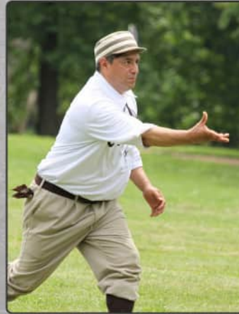
"Knapsack" of the Brownstockings pitches.

Thanks to the gracious invitation of the St. Louis Brownstockings, the Salmon will be participating in the eighth annual St. Louis Cup on Saturday, July 15th. The Cup features 13 clubs playing across five fields, for a total of 17 vintage matches in one day! Matches start at 9:00am and finish at 4:15pm. The Salmon are playing three matches on Saturday, as well as a fourth match on Sunday in nearby Belleville, IL.