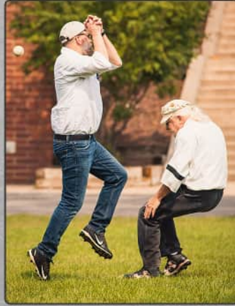
Pipes makes his base during a match against the Blue Island Brewmasters in 2021.

At the kind invitation of the Frederick Law Olmsted Society, the Salmon are traveling to the historic village of Riverside, IL on Saturday, July 30th to meet the Blue Island Brewmasters for a match. A haven for architecture and history buffs, Riverside was designed by legendary landscape architects Olmstead and Vaux (designers of Central Park and more). Big Ball Park was included in this original design, and base ball fans will appreciate that one of the first village developers was a founder of the Chicago White Stockings (known as the Cubs today)! The match begins at 1:00pm at Big Ball Park.