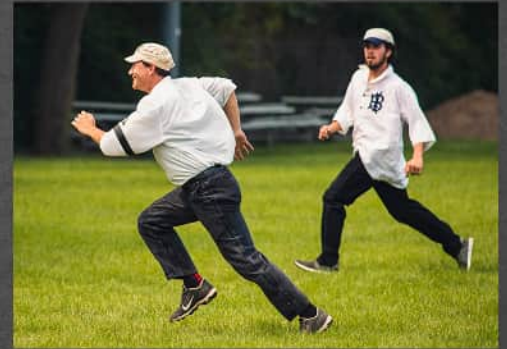
Dizzy catches a fly ball and Nickels sprints to third during last year's victorious match against the Blue Island Brewmasters.