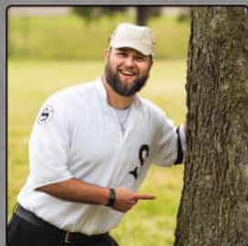
June 11 vs. Railroaders W 22 - 10