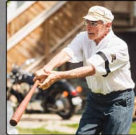
June 3 vs. Red Stockings W 10 - 5