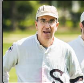
May 20 vs. Brewmasters W 7 - 5