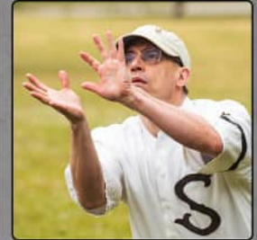
June 11 vs. Lookouts W 15 - 2