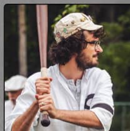
September 17 vs. Echoes W 14 - 7