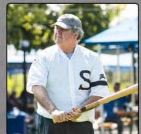
August 27 vs. Grays L 3 - 13