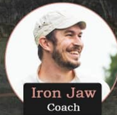
Iron Jaw Coach