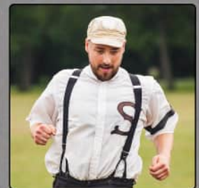
July 15 vs. Wahoo BBC W 12 - 11