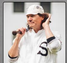
October 8 vs. Grinders W 15 - 5