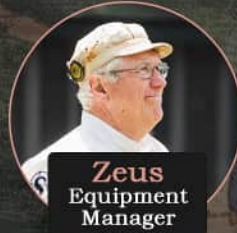
Zeus Equipment Manager