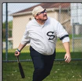
September 16 vs. Railroaders L 12 - 13