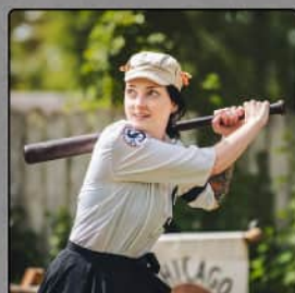
September 16 vs. Lookouts W 14 - 7