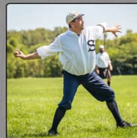
August 19 vs. Grinders W 13 - 5