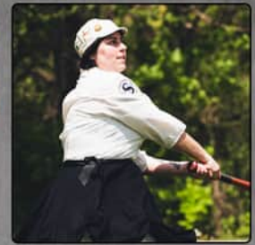
May 6 vs. Long Nine L 6 - 7