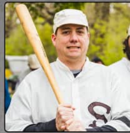
April 30 vs. Grinders W 19 - 5

Miles Traveled: 2,050 (From H.M.C. Round Trip)