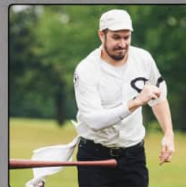
July 15 vs. Monitor BBC L 2 - 22