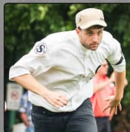
August 13 vs. Brewmasters W 10 - 3