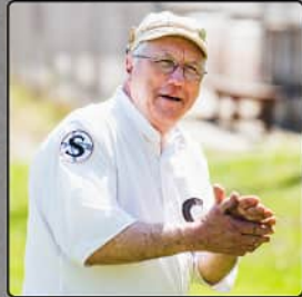
May 6 vs. Prairie Chickens L 4 - 8