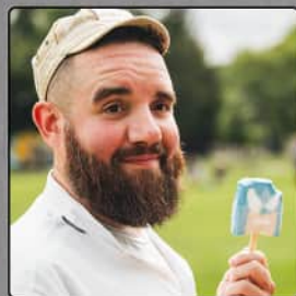
August 6 vs. Independants W 22 - 4