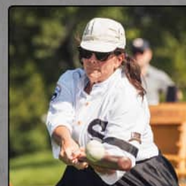
September 30 vs. Quarrymen W 24 - 21