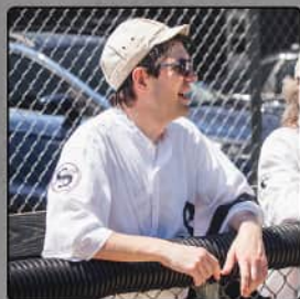
July 29 vs. Dutchers W 24 - 14