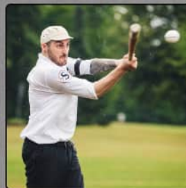
July 15 vs. Dutchers W 9 - 8