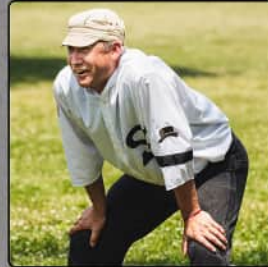
June 3 vs. Grays L 3 - 4