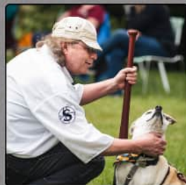
July 8 vs. Grays W 20 - 8