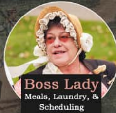
Boss Lady Meals, Laundry, & Scheduling